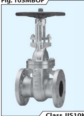
Class JIS 10K