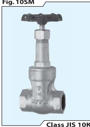
Class JIS 10K